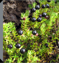
KUKAENENE BRANCHES & BERRIES