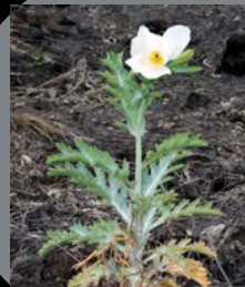
PUA KALA BRANCHES & FLOWERS